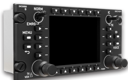
Audio Control Unit