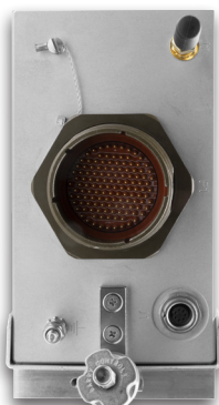
Audio Remote Unit with mounting tray