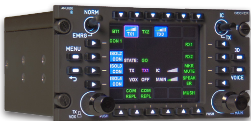
Audio Management Unit