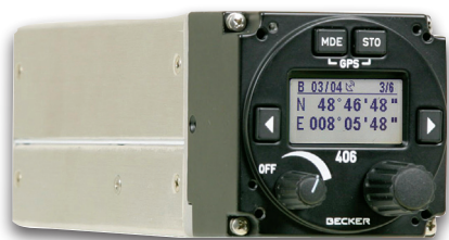
BD406 Single Block Beacon Decoder

The PBD406 is the portable version with its own battery, internal speaker, battery charger and inputs for RX and GPS antennas. It includes a BD406 single block device with control head.