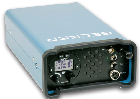
PBD406 Portable Beacon Decoder