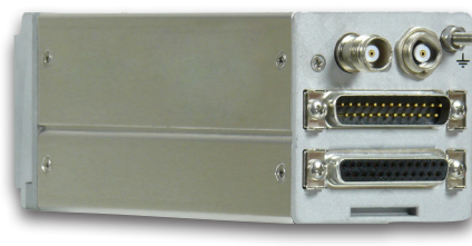
BD406-(003) Remote device without control head